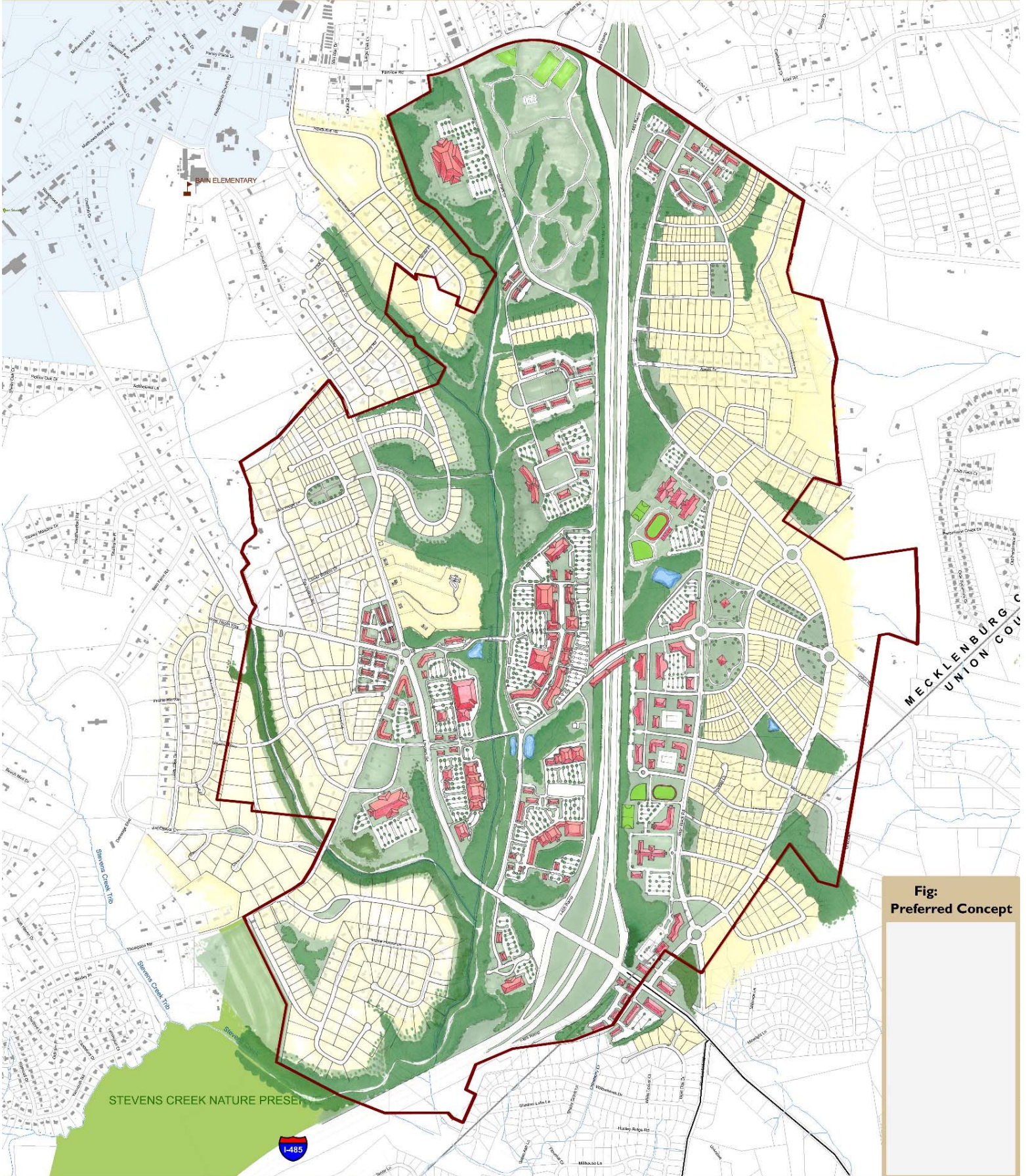
Fig: Preferred Concept